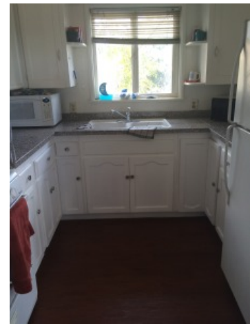
Kitchen cabinet & counter replacement