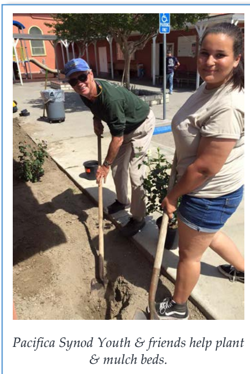
Pacifica Synod Youth & friends help plant & mulch beds.

For a calendar and other information, visit www.cclm.org or call (909) 381-6921.